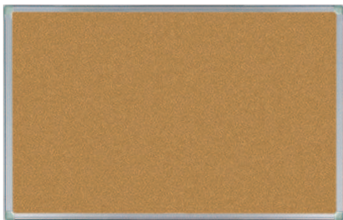
NATURAL CORK BOARDS